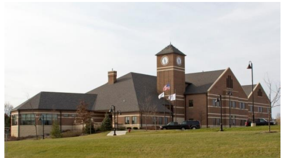
Oswego Village Hall

The Village of Oswego operates under the Village President-Village Trustee form of government with an appointed Village Administrator. The Village President and six Trustees are elected at large for four-year overlapping terms and serve as the legislative branch of Village government. The Trustees are responsible for adopting policies affecting Village affairs, approving the Village budget, enacting ordinances and resolutions, and guiding the Village operations. The Village President is the chief executive officer of the Village and chairs meetings of the Village Board. The Economic Development Director is appointed by the Village President, with advice and consent of the Village Trustees, and supervised by the Village Administrator.